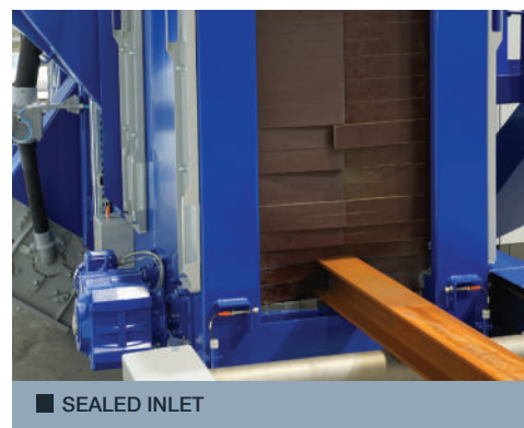
■ SEALED INLET