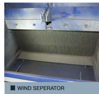
■ WIND SEPERATOR

Just switch on the roller conveyor and a PLC takes over the entire process, monitors the material transfer speed, automatically starts the abrasive recycling system, and starts the blast wheels sequentially one at a time as the profile arrives inside the blast chamber. When the leading edge of the profile leaves the blast area, the blow-off motor starts automatically and removes residual shot from all surfaces. As the trailing end of the profile leaves the chamber, the whole system shuts down in sequence, thus eliminating wasted power, saving you money