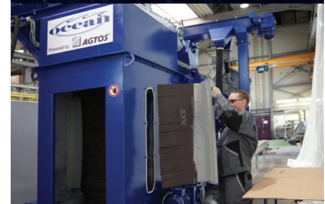
■ SIMPLE MODULAR GASKET