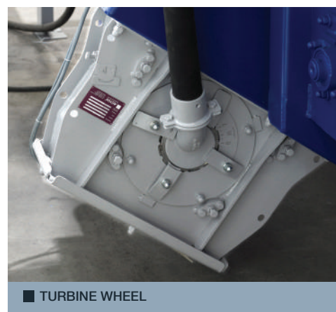
■ TURBINE WHEEL