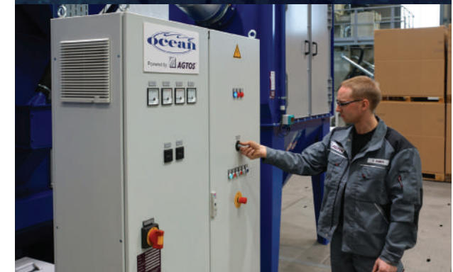
■ CONTROL CABINET