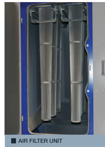
■ AIR FILTER UNIT